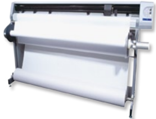
Ioline 600 AeX / 600Ae / 28Ae